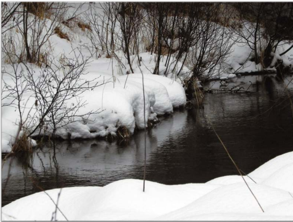
Military Creek, Phelps.