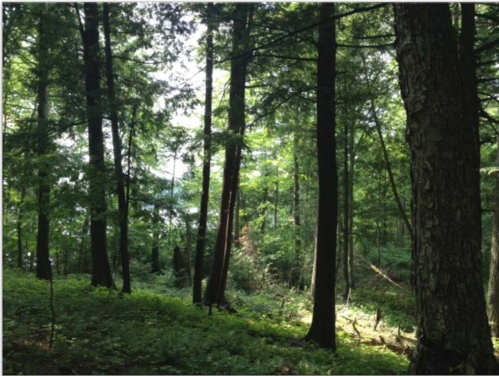
Van Vliet Hemlocks, Presque Isle.