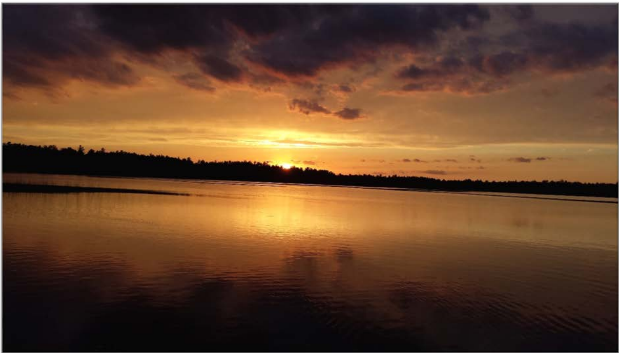
Cisco Chain, Land O' Lakes, Wisconsin